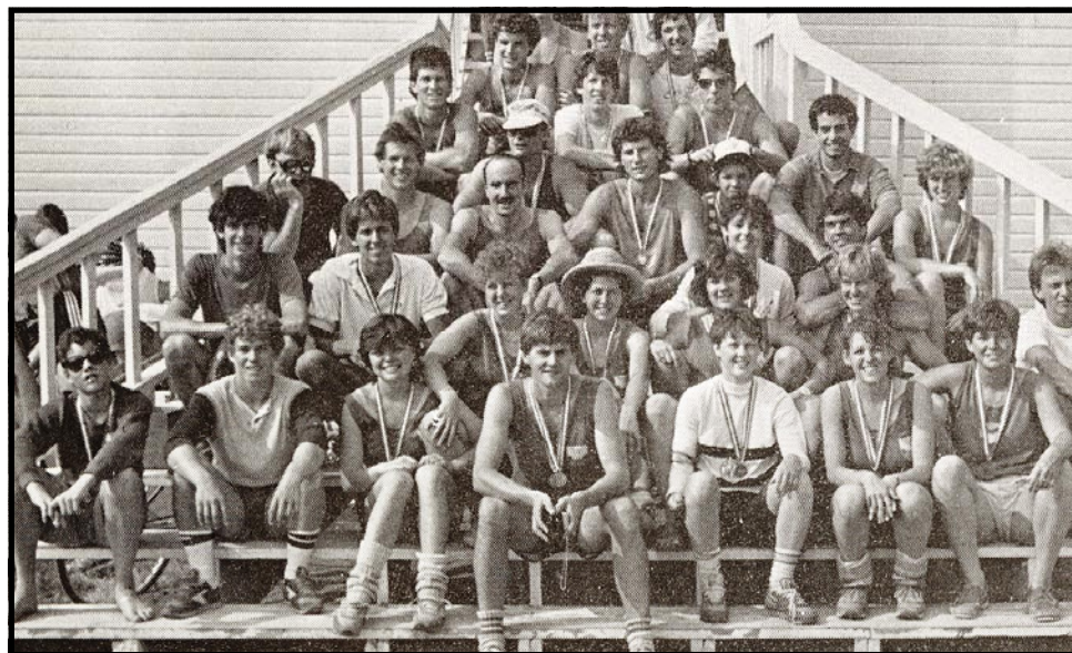
PETERBOROUGH ROWING CLUB SUMMER 1985