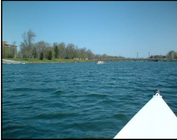
BANANA BELT TOUR, MAY 3, 2009