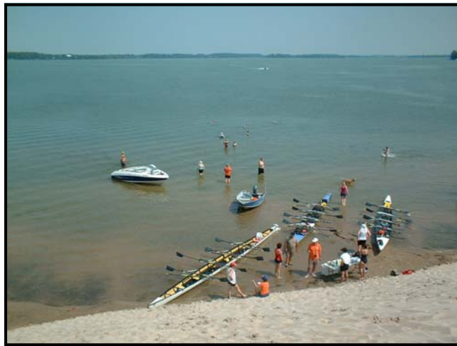
WHINE AND ROW, 2009 EAST LAKE LUNCH BREAK